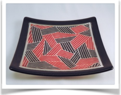
Variation #1: Black and Cherry Red frit topped with Spectrum Double Thick Clear sheet glass