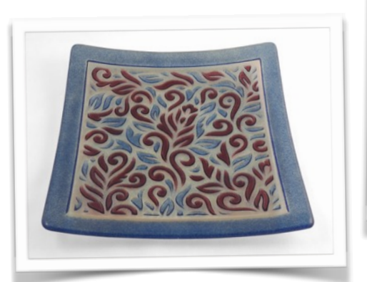
Variation #1:Turns Pink and Light Blue frit and Spectrum Double-Thick Clear

3. Cut double-thick, clear glass into squares or other small shapes. Top each shape with between 10 and 20 grams of powder or fine, transparent frit. Stabilize the frit with a bit of "extra hold" hair spray and place each square, frit side up, anywhere within the texture portion of a pattern fuser. Fire according to one of the two casting schedules. When cool,