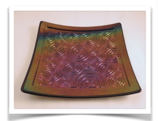
Variation #2: Uroboros Black Iridized Glass