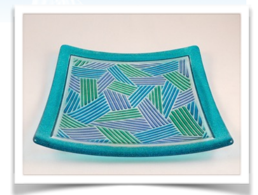
Variation #1: Uroboros Teal Green, Light Blue, and Deep Aqua frit