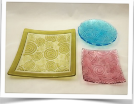
Variation #3: Shows range of shape and sizes that can be created